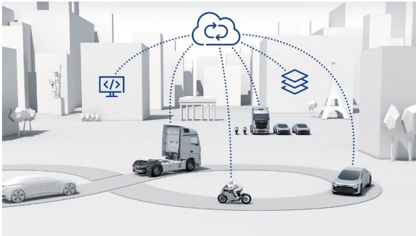
Image 1: PANTARIS is a secure, cloud-based integration platform with developer portal, manufacturer-independent marketplace, and its own strong service portfolio