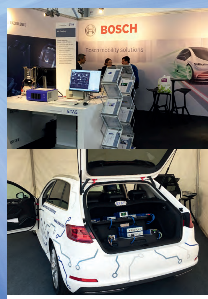
ETAS UK participated together with Bosch in the Cenex Low Carbon Vehicle Event in Millbrook, United Kingdom. ETAS Demo Car, equipped with INCA-TOUCH and ETAS hardware, was again a highlight.